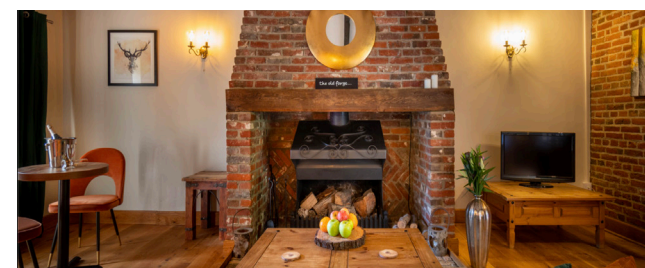
The Farmhouse at Fincham

“Everything about Watatunga is excellent. Superb arrangements for booking, excellent knowledge on the tour, wonderful experience seeing these fabulous animals and birds in natural habitat. Staff are friendly, knowledgeable, and accommodating.” July 2022