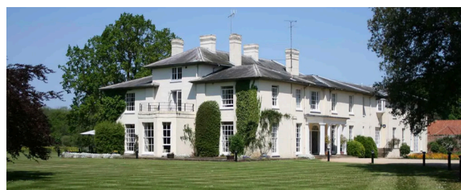
Congham Hall Spa